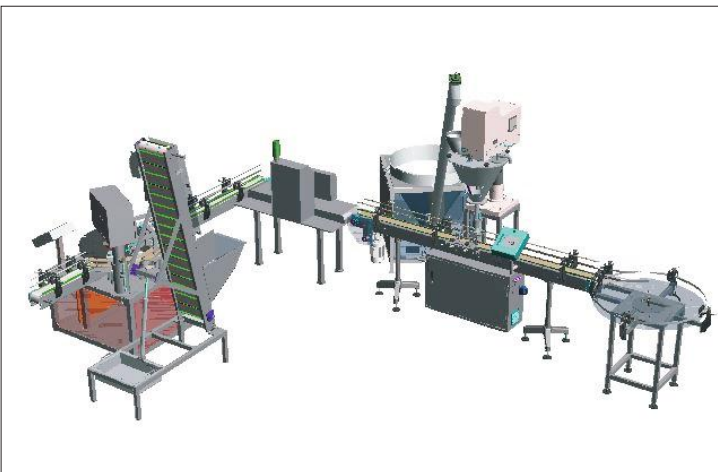
Jar Filling Line with Auger Filler