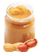
Peanut butter and Sauces