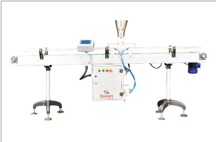
Single Track Filling Line