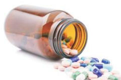
Pharmaceutical powder & tablets